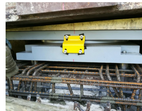
Serie ERGOFLON DISC