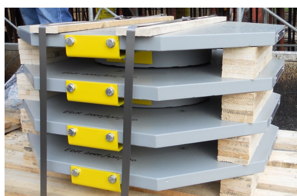
SERIE ERGOFLON DISC